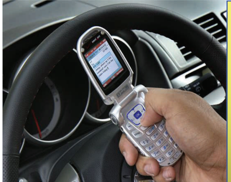
In 2009, there were 5,474 fatalities and 448,000 injuries associated with districted driving in the US.

Ray Lahood, the US Transportation Secretary, is considering a nationwide ban of cell phone use in cars. It is an uphill struggle, though, as each